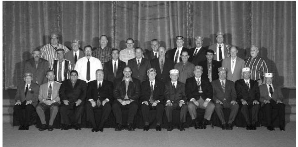
Tulsa Scottish Rite Past Masters Class November 1-2, 2003